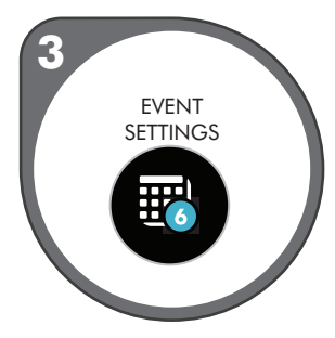
SET-UP A SCENT EVENT

Start with the knob at the "12:00" position and adjust to fit your space.