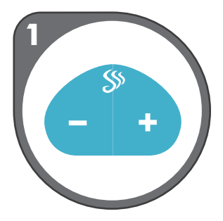
CHOOSE THE SCENT LEVEL

This controls the scent intensity of the cartridge. There are seven levels, one (1) is low intensity, seven (7) is high intensity.